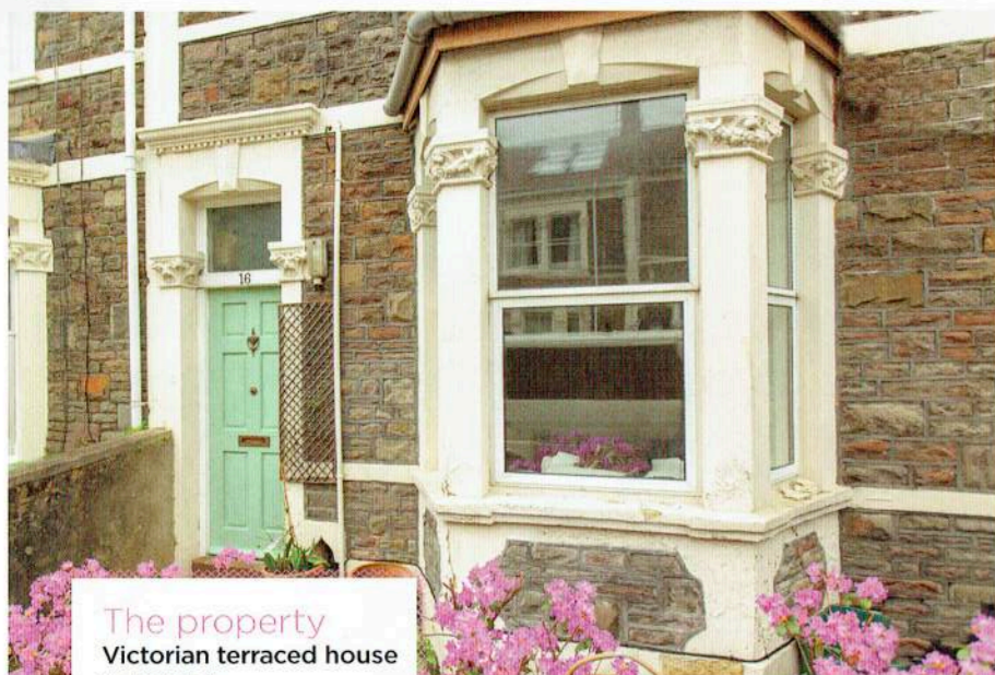
The property Victorian terraced house in Bristol.

FEATURE VICTORIA JENKINS